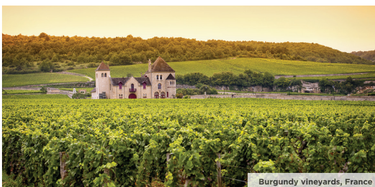
Burgundy vineyards, France