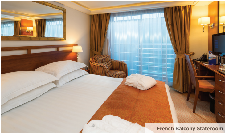
French Balcony Stateroom

7-night river cruise from Dijon to Lyon October 30-November 6, 2025 | AmaCello